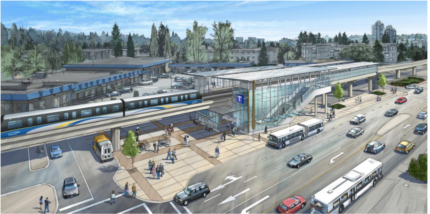
Burquitlam Station artist rendering